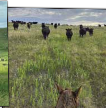
Rotating pastures in the hills in the middle of the summer.