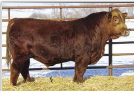
KS Mr Red Rock J657 Herd sire at Kenners and Maternal brother to Lot 24