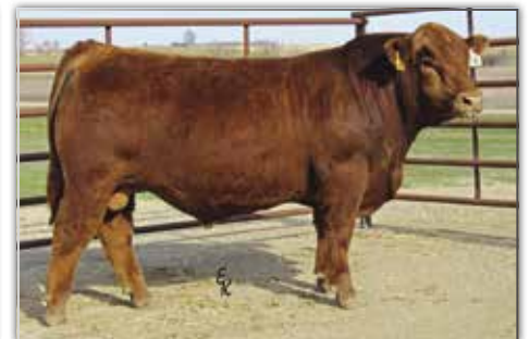
BGL Rooster D181B High-selling bull in 2017 to Kunkel Simmentals and maternal brother to Lot 63