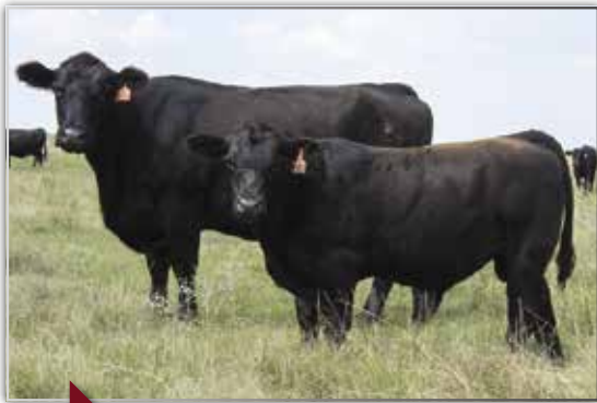
Lot 15 and his dam in the pasture this summer.