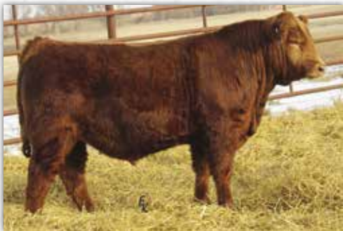
KS Net Income H433 | PB SM | ASA# 3713043 Hook's Full Figures 11F x TNT Gentleman Jack EPDs 19 -2.2 73 114 12 26 63 API 177 TI 91

Semen available through Doll Simmental and Crosshair Simmentals