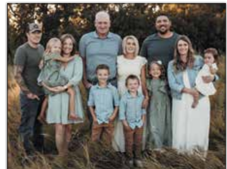
The Leapaldt Family