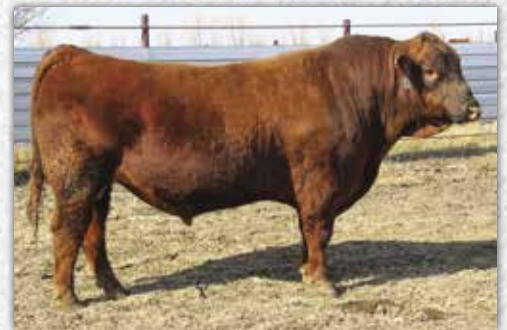
KS Mr Full Figures H113 | PB SM | ASA# 3712891 Hook's Full Figures 11F x BCLR ShamWow EPDs 14 -0.4 82 126 9 31 72 API 160 TI 89

Semen available through Genex & owned by TNT Simmentals