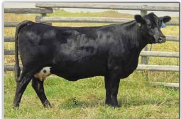
KS Federica F298 - Dam of Lot 22 and KS Dominance (sire of Lots 53-56)