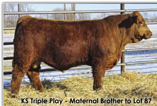
KS Triple Play - Maternal Brother to Lot 87

• Maternal brother to KS Triple Play - who sold to G&D Simmentals quite a few years ago.