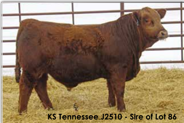
KS Tennessee J2510 - Sire of Lot 86