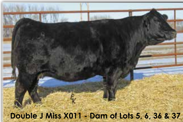
Double J Miss X011 - Dam of Lots 5, 6, 36 & 37