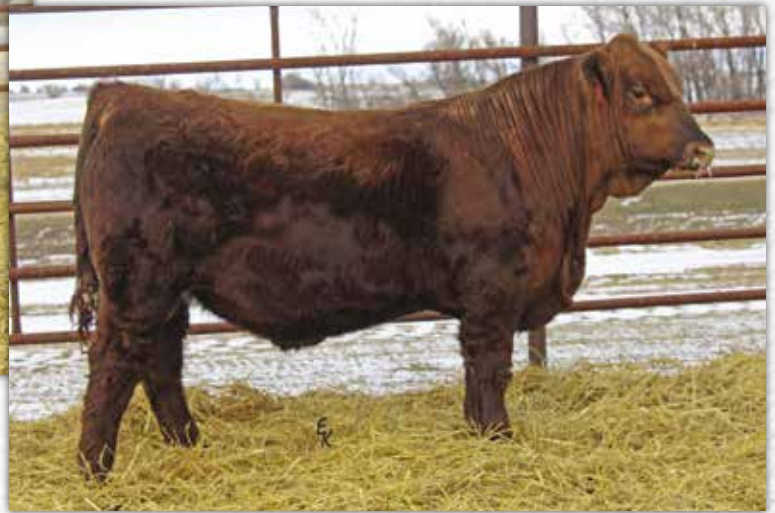
KS Vanderbilt G220 | 3/4 SM 1/4 AR | ASA# 3603989 RFS Bulletproof x HXC Conquest EPDs 11 0.9 104 169 7 21 73 API 128 TI 92