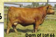
Dam of Lot 66