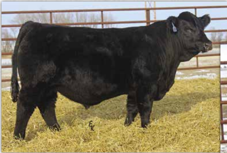
KS Dutton H542 | PB SM | ASA# 3713128 Koch Big Timber x RBS Boise EPDs 9 2.1 95 141 6 28 75 API 125 TI 86

PAST SALE HIGHLIGHTS AVAILABLE TO USE IN YOUR PROGRAMS TODAY!