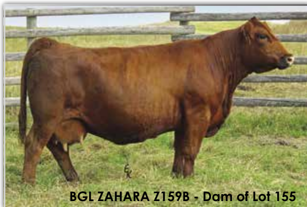
BGL ZAHARA Z159B - Dam of Lot 155