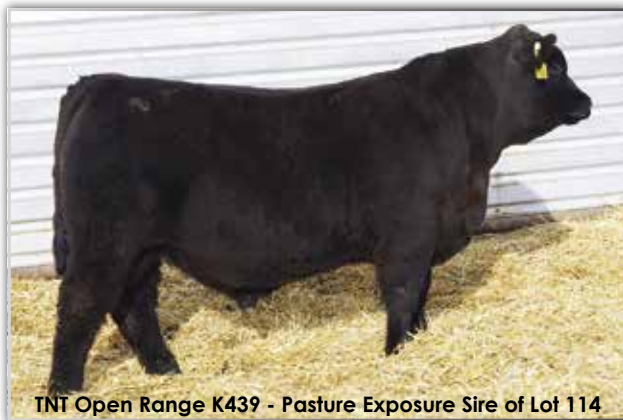
TNT Open Range K439 - Pasture Exposure Sire of Lot 114