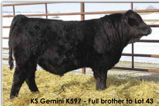
KS Gemini K597 - Full brother to Lot 43

• Dam is a daughter of the B33 donor cow.