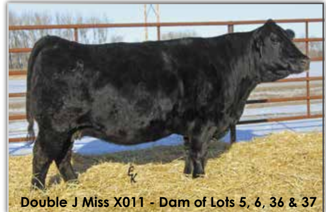
Double J Miss X011 - Dam of Lots 5, 6, 36 & 37