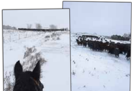
Moving cows out of the hills after the October blizzard!