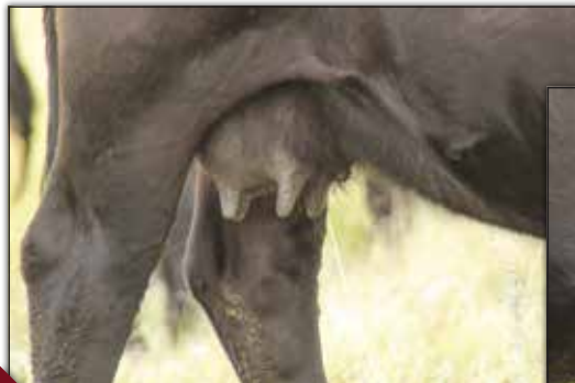
Udder of Dam of Lot 42 in the pasture in 2024.