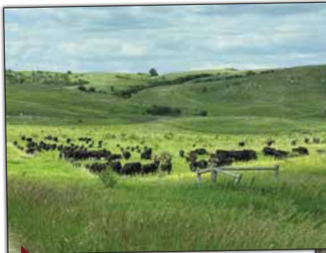
Cows grazing in the hills in early June when the grass was green!