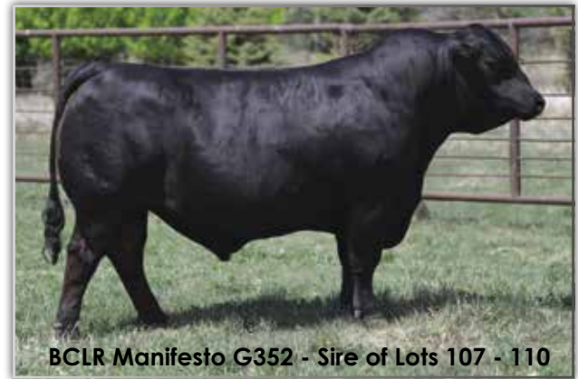
BCLR Manifesto G352 - Sire of Lots 107 - 110