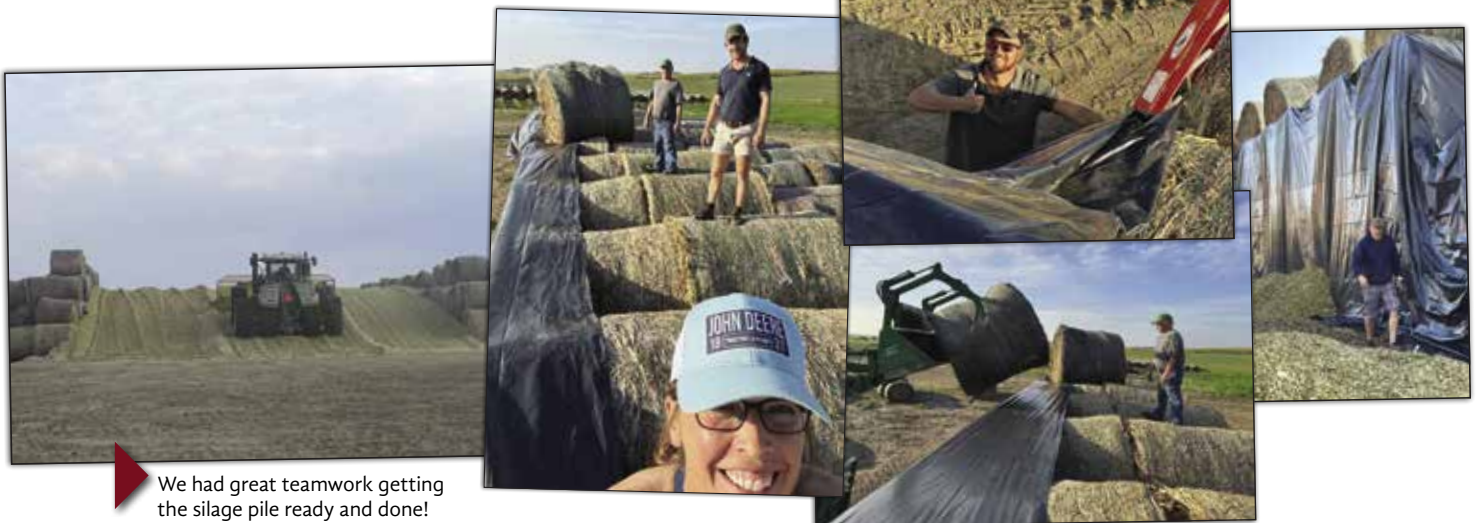
We had great teamwork getting the silage pile ready and done!