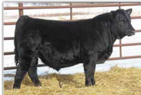
KS Rip K657 Sold to Shawn Sandmeyer, MN in 2023 Sale and maternal brother to Lot 64