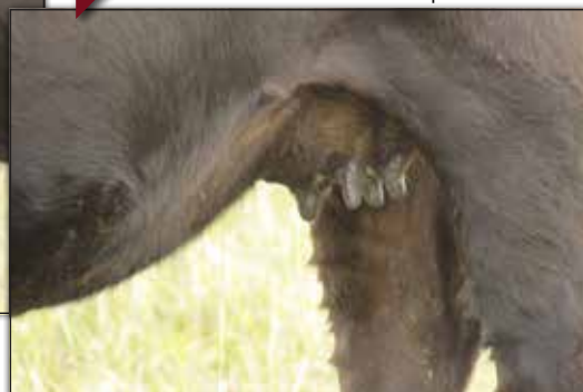
Udder of Dam of Lot 45 in the pasture in 2024.